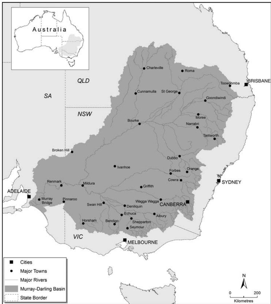
Figure 1. Map of Australia’s Murray–Darling Basin.

Australia’s MDB is a 1 million km 2 , multi-jurisdictional basin, occupying portions of the States of Queensland, New South Wales, Victoria and South Australia, and the Australian Capital Territory (Figure 1). The MDB comprises the Murray, Darling and Murrumbidgee rivers, three of Australia’s longest rivers, and their tributaries. The MDB is a semi-arid river system with highly variable stream flow (Peel, McMahon, & Finlayson, 2004), one of the most variable in the world (Kirby et al., 2006). The basin is mostly low-lying and